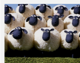
Patoka School Newsletter